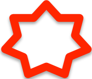
Location of UMD Disability Summit