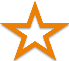
Location of Parking Lots